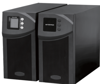
External Battery Cabinet (Optional)